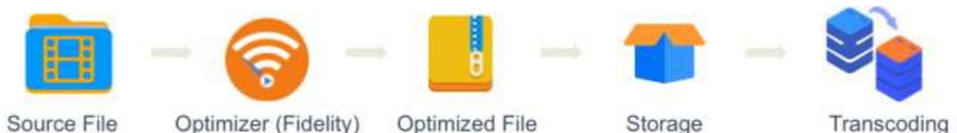
Figure1. VisualOn Optimizer(Fidelity) Workflow